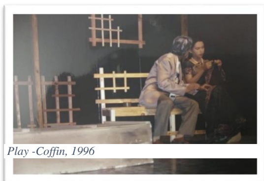
Play -Coffin, 1996

No More Faustus - the adaptation from Christopher Marlowe's classic The Tragical History of the Life and Death of Doctor Faustus in 1993. He also directed, acted, and wrote several plays including organizing and conducting workshops and seminars at home and abroad in his early career of theatre. During that time, he developed himself as a playwright too and his play Jai Desete (1992), Coffin , (1996) got positive criticism from audience and critics.